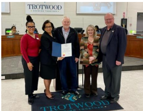
Ohio Auditor of State Award with Distinction Presentation

A call to action is made to support our schools. The backing they receive directly influences the quality of education our students receive, and a thriving community is built when our young people acquire the knowledge, skills, and competencies necessary for their intellectual development.