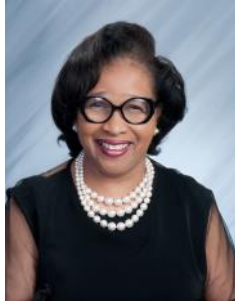
Yvette F. Page Vice Mayor Ward 2