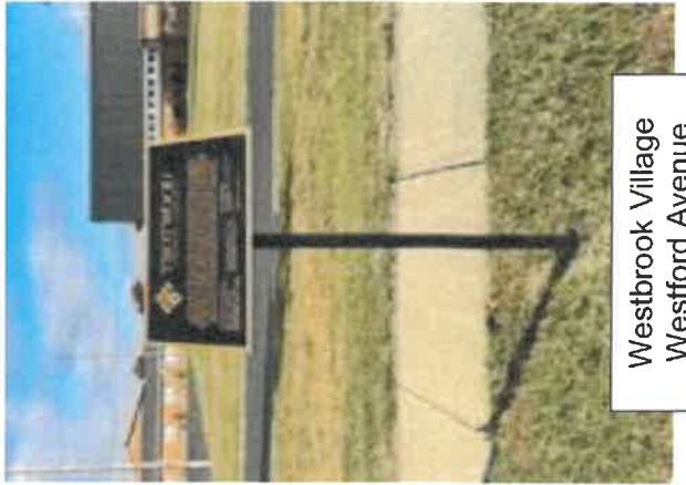
Westbrook Village Westford Avenue