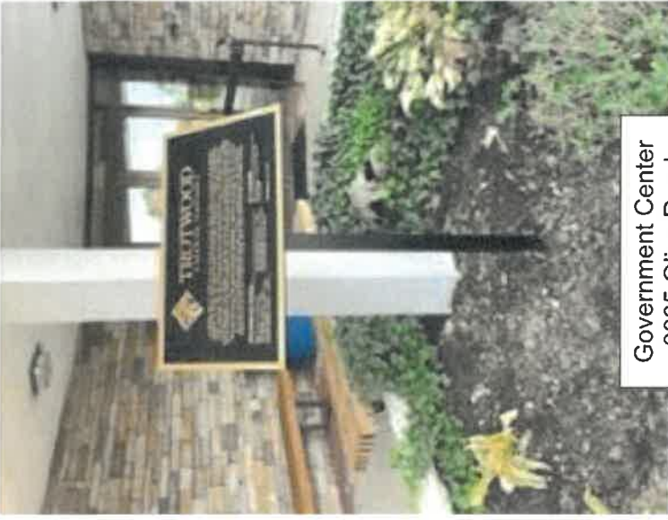
Government Center 3035 Olive Road