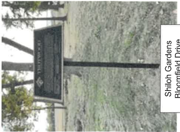
Shiloh Gardens Bloomfield Drive