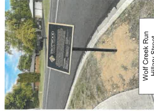
Wolf Creek Run Hillary Street