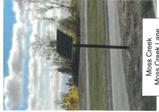
Moss Creek Moss Creek Lane